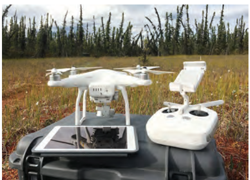
Come Learn, Grow and Succeed With Us